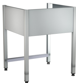
MAXIMA Frame for Maxima