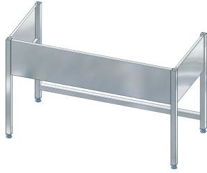
MAXIMA Frame for Maxima