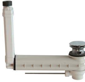
Drain and overflow set