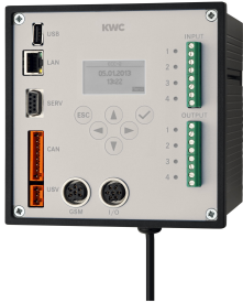
ECC2 function controller