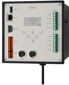
ECC2 function controller