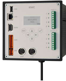
ECC2 function controller