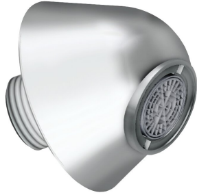
Wall outlet, DN 15