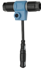
Electrical T junction