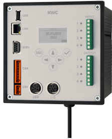
ECC2 function controller