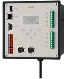
ECC2 function controller