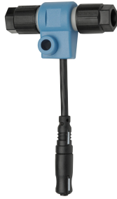
Electrical T junction