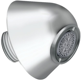
Wall outlet, DN 15

Modell-Linie: HEAVYDUTY | HDTX806M Heavy Duty | Prison units