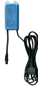
Power supply unit