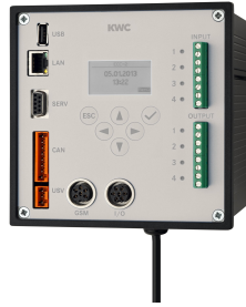
ECC2 function controller