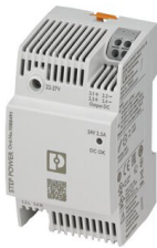
Power supply unit 2030068573 ASEX1031

Modell-Linie: LIGHT-BARRIER | AQRE440 Flushing systems | Electronic urinal flushing systems