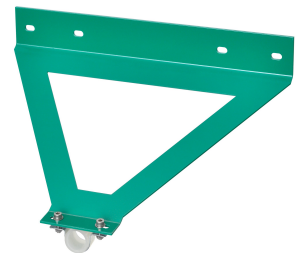
Wall arm holder