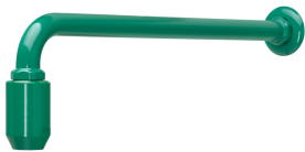
Emergency showerhead with wall bracket