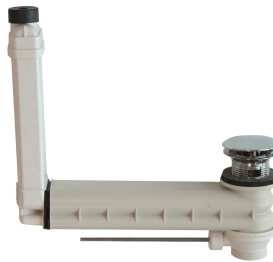
Drain and overflow set