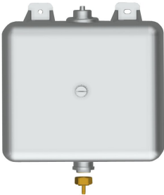
ALL-IN-ONE soap tank