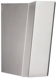
ANIMA trap cover