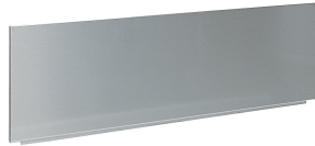
ANIMA splash back