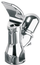
Self-closing drinking bubbler