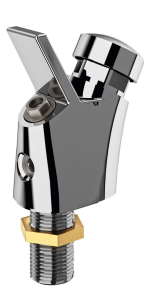
ANIMA drinking fountain tap

Modell-Linie: ANIMA | SIRW24D Drinking fountains | Drinking fountains