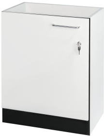
Cabinet for installation under the tabletop