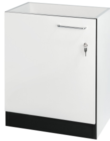
Cabinet for installation under the tabletop