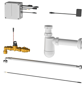
Electronic trap control