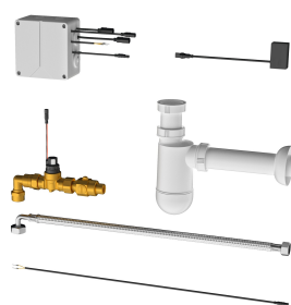
CAMPUS slab urinal connector