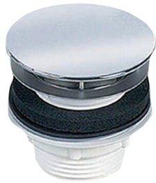
Dome waste valve