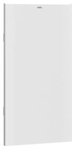
EXOS. front with white safety glass panel