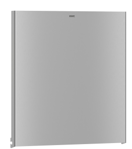
EXOS. front with white safety glass panel