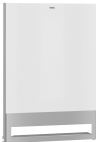
EXOS. front with white safety glass panel