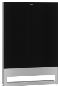
EXOS. front with black safety glass panel

Modell-Linie: EXOS | EXOS637X Accessories | Paper towel dispensers