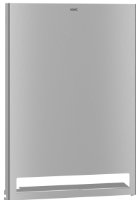
EXOS. stainless steel front for paper towel dispenser

Modell-Linie: EXOS | EXOS637B Accessories | Paper towel dispensers