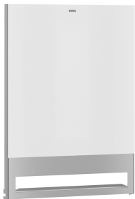
EXOS. front with white safety glass panel