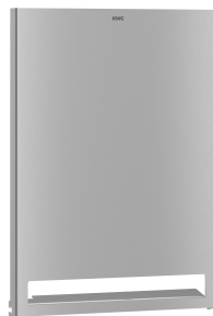
EXOS. stainless steel front for paper towel dispenser