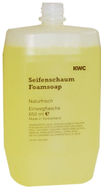
Foam soap cartridge 2030058766 EXINX616FP