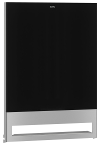
EXOS. front with black safety glass panel