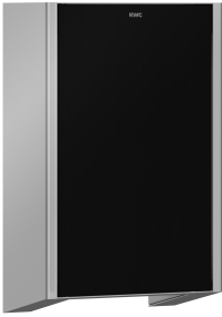
EXOS. front cover with black safety glass panel