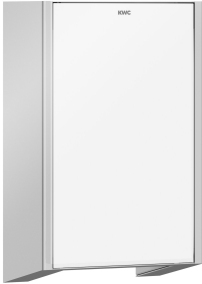
EXOS. front cover with white safety glass panel