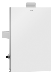
EXOS. front with white safety glass panel