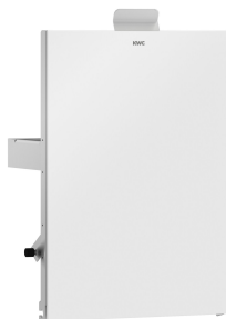
EXOS. front with white safety glass panel