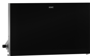
EXOS. front with black safety glass panel

Modell-Linie: EXOS | EXOS676X Accessories | WC-roll holders