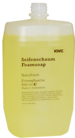
Foam soap cartridge