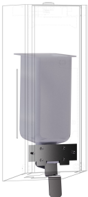
EXOS. conversion kit for liquid soap dispenser