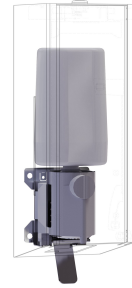
EXOS. conversion kit for foam soap dispenser