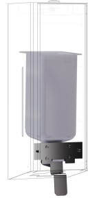
EXOS. conversion kit for liquid soap dispenser