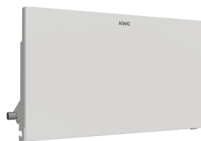
EXOS. front with white safety glass panel