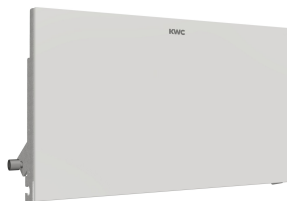
EXOS. front with white safety glass panel