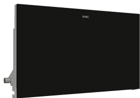
EXOS. front with black safety glass panel

Modell-Linie: EXOS | EXOS676EX Accessories | WC-roll holders