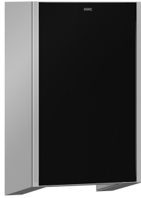
EXOS. front cover with black safety glass panel