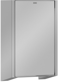
Interchangeable front panels for EXOS. hand dryers