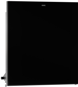
EXOS. front with black safety glass panel 2030034648 ZEXOS600EB