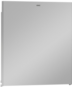
EXOS. stainless steel front for paper towel dispenser for recessed mounting 2030034647 ZEXOS600E

Modell-Linie: EXOS | EXOS600EW Accessories | Paper towel dispensers