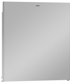
EXOS. stainless steel front for paper towel dispenser for recessed mounting

Modell-Linie: EXOS | EXOS600EW Accessories | Paper towel dispensers