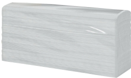
Paper towels 2030072378 FH70P