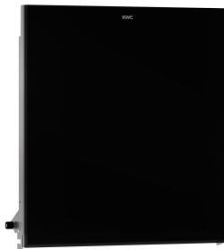
EXOS. front with black safety glass panel