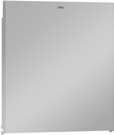
EXOS. stainless steel front for paper towel dispenser for recessed mounting 2030034647 ZEXOS600E

Modell-Linie: EXOS | EXOS602EW Accessories | Combinations