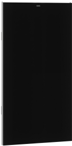
EXOS. front with black safety glass panel 2030022931 ZEXOS605B