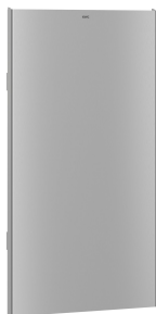
EXOS. stainless steel front for waste bin for wall and recessed mounting

Modell-Linie: EXOS | EXOS605EW Accessories | Waste bins