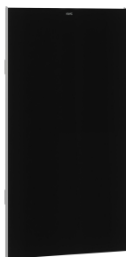
EXOS. front with black safety glass panel