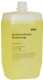
Foam soap cartridge