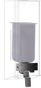
EXOS. conversion kit for liquid soap dispenser