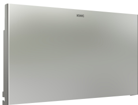
EXOS. stainless steel front for EXOS. double toilet roll holder for recessed mounting

Modell-Linie: EXOS | EXOS676EW Accessories | WC-roll holders