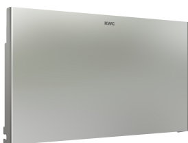
EXOS. stainless steel front for EXOS. double toilet roll holder for recessed mounting

Modell-Linie: EXOS | EXOS676EW Accessories | WC-roll holders