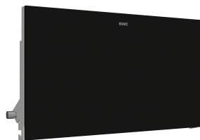
EXOS. front with black safety glass panel