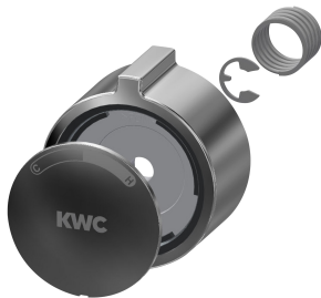
Handle push cap