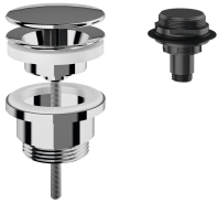
Dome waste valve, chrome-plated