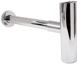
Dome waste valve, chrome-plated