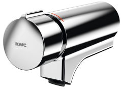
F5S-Mix self-closing single-mixer for fitting unit or wall flange