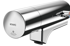
F5E-Mix electronic washbasin mixer for fitting unit or wall flange