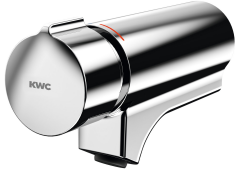
F5S-Mix self-closing single-mixer for fitting unit or wall flange