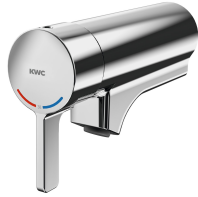
F5L-Therm single-lever thermostatic mixer for tap unit or wall flange