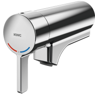
F5L-Therm single-lever thermostatic mixer for tap unit or wall flange