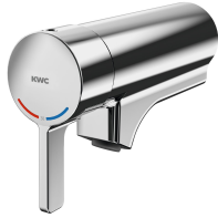
F5L-Therm single-lever thermostatic mixer for tap unit or wall flange