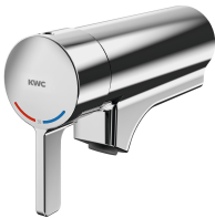
F5L-Therm single-lever thermostatic mixer for tap unit or wall flange