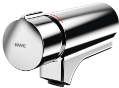
F5S-Mix self-closing single-mixer for fitting unit or wall flange

Modell-Linie: FITTING-UNITS | AQFU0232 Taps | Fitting units