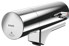
F5E-Mix electronic washbasin mixer for fitting unit or wall flange